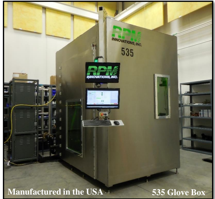
Manufactured in the USA