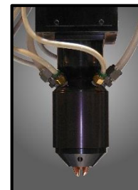
Optional: ID Deposition Head